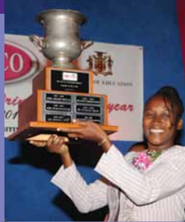
Teacher of the Year 2009/2010 (Ewarton High School)